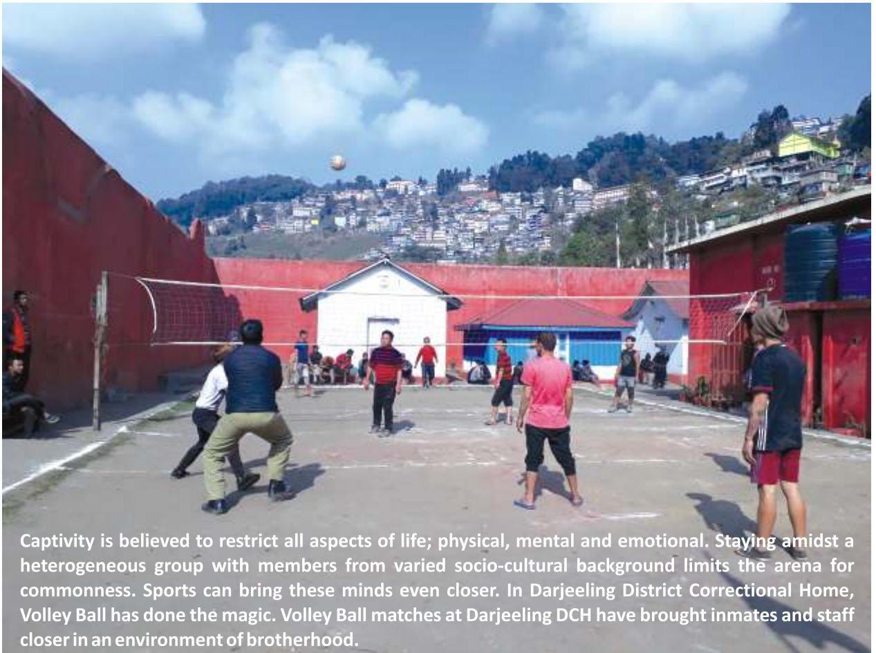
Captivity is believed to restrict all aspects of life; physical, mental and emotional. Staying amidst a heterogeneous group with members from varied socio-cultural background limits the arena for commonness. Sports can bring these minds even closer. In Darjeeling District Correctional Home, Volley Ball has done the magic. Volley Ball matches at Darjeeling DCH have brought inmates and staff closer in an environment of brotherhood.