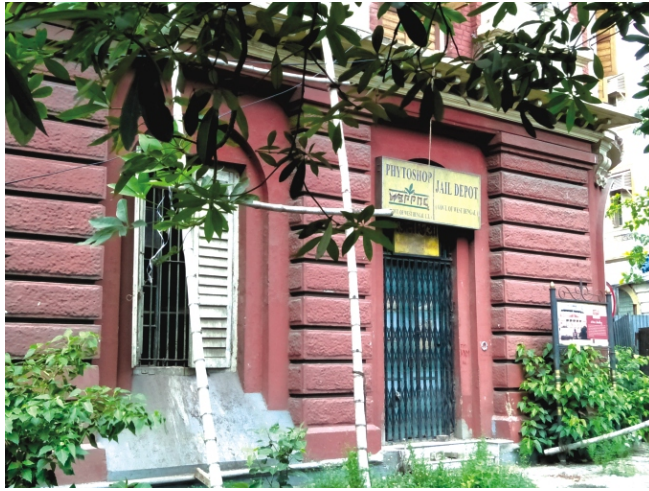
Old Jail Depot at Writers Buildings