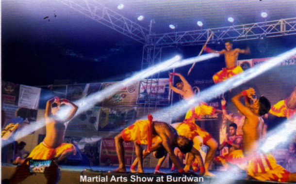
Martial Arts Show at Burdwan