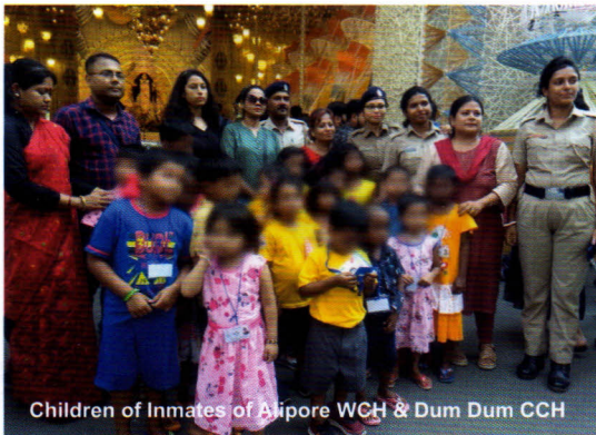
Children of Inmates of Alipore WCH & Dum Dum CCH

The children of the inmates residing at Dum Dum Central Correctional Home and Alipore Women's Correctional Home celebrated Durga Puja by visiting Kolkata's famous Puja Pandals – MUDIYALI CLUB, EKDALIA EVERGREEN CLUB, SINGHI PARK SARBOJONIN, TRIDHARA SAMMILANI and CHETLA AGRANI. This initiative, named "PRONAM", got success through the joint efforts of Directorate of Correctional Services and Kolkata Police.