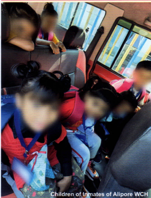
Children of Inmates of Alipore WCH

A new initiative has been taken to enrol the children of school going age residing with their mothers inside Correctional Home. Already 14 children from Alipore Women's Correctional Home and Krishnanagar District Correctional Home have been enrolled in regular schools.