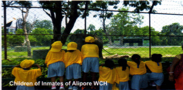
Children of Inmates of Alipore WCH

Children of the inmates of Alipore Women's Correctional Home visited Alipore Zoo last winter. They saw various types of animals and had a gala time enjoying in the fresh air outside the confinement of the Correctional Home.