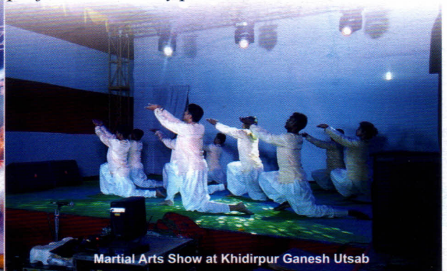
Martial Arts Show at Khidirpur Ganesh Utsab