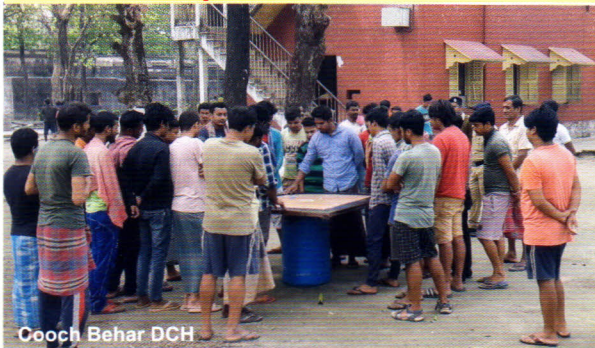
Cooch Behar DCH

Group activities cultivate the spirit of sportsmanship within individuals. To inculcate this feeling of enthusiasm within the inmates, Cooch Behar District Correctional Home organized a Carrom Tournament amongst various teams of inmates.