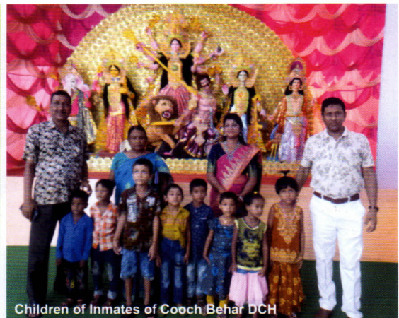
Children of Inmates of Cooch Behar DCH