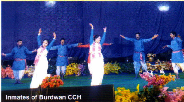
Inmates of Burdwan CCH

All Correctional Homes motivate the inmates to participate in various Cultural activities for keeping them mentally and physically fit. One such dance performance was staged by the inmates of Burdwan CCH at Sankhir Pukur Utsav Maidan, Burdwan, during the Burdwan Poura Utsav.